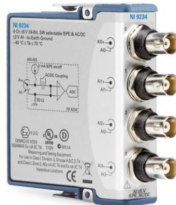
NI 9234 Sound and Vibration Module

Accuracy = Reading*Gain Error + Range*Offset Error + Noise Uncertainty