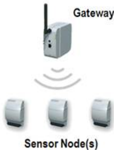
Figure 1. WSN Components, Gateway, and Distributed Nodes

A wireless sensor network (WSN) is a wireless network consisting of spatially distributed autonomous devices using sensors to monitor physical or environmental conditions. A WSN system incorporates a gateway that provides wireless connectivity back to the wired world and distributed nodes (see Figure 1). The wireless protocol you select depends on your application requirements. Some of the available standards include 2.4 GHz radios based on either IEEE 802.15.4 or IEEE 802.11 (Wi-Fi) standards or proprietary radios, which are usually 900 MHz.