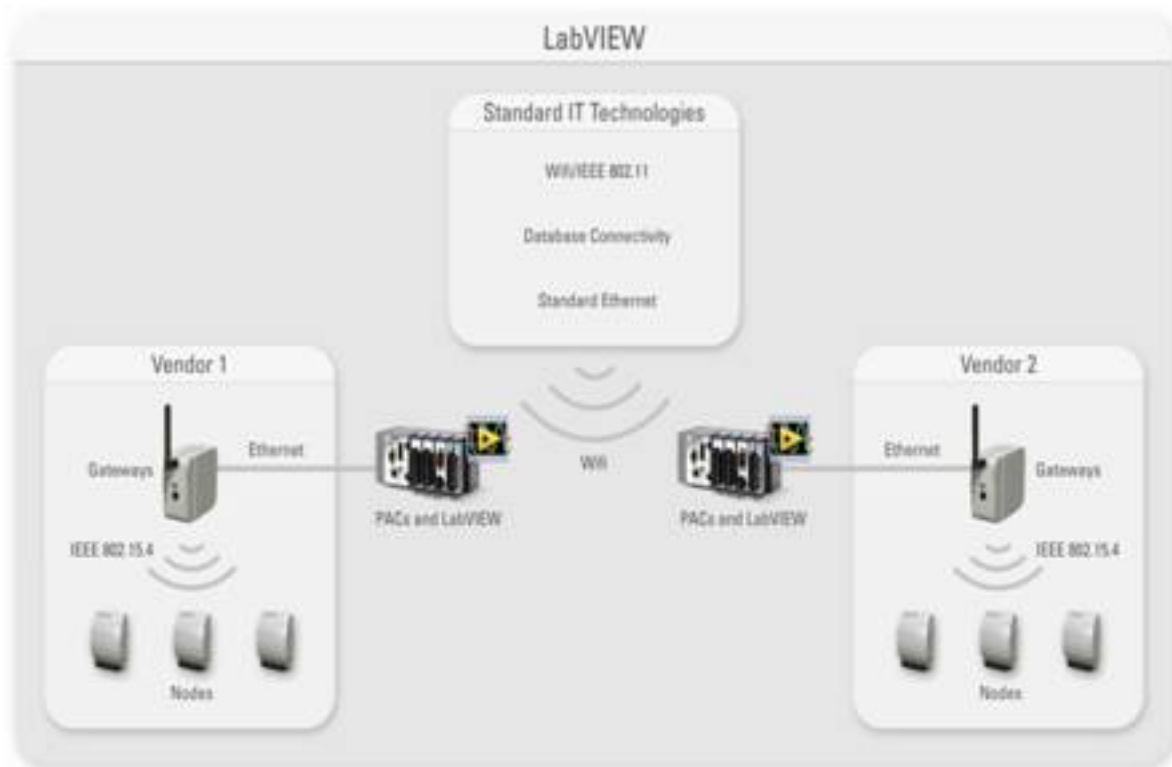
Figure 2. WSN System Architecture Combines Wired and Wireless

Wireless technology offers several advantages for those who can build wired and wireless systems and take advantage of the best technology for the application. To do this, you need a flexible software architecture like the NI LabVIEW graphical system design platform. LabVIEW offers the flexibility needed to connect a wide range of wired and wireless devices (see Figure 2).