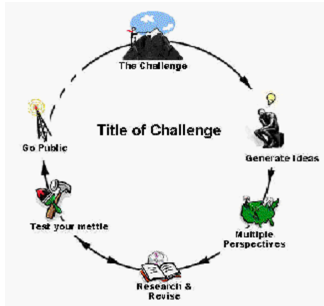
Figure 2. The STAR Legacy Cycle