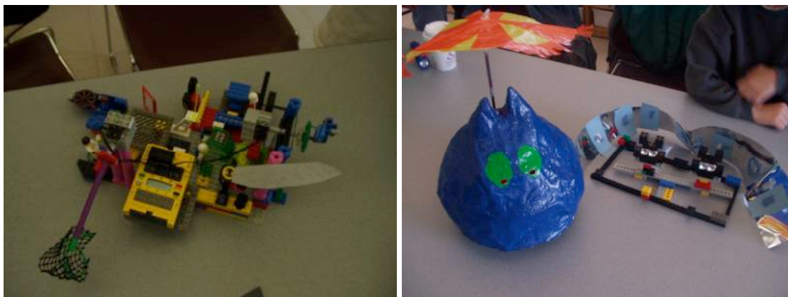
An Amusement Park and the Vit-Vit

We did not try to teach the children in order to guide them in a certain direction or take a certain view of engineering, and the result is that they believe that engineering can be a method of expressing themselves.